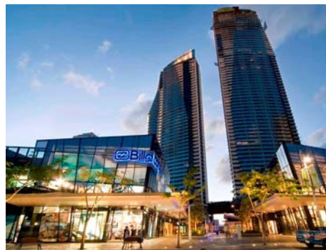
Circle on Cavill